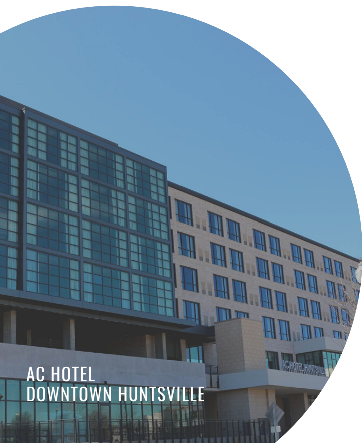
AC HOTEL DOWNTOWN HUNTSVILLE

Present opportunities for women to connect and build meaningful relationships with leaders on all levels